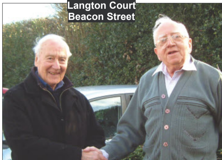
Langton Court Beacon Street