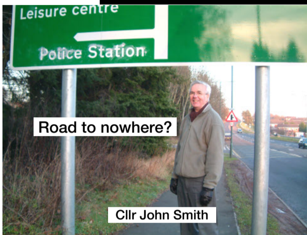
Road to nowhere?